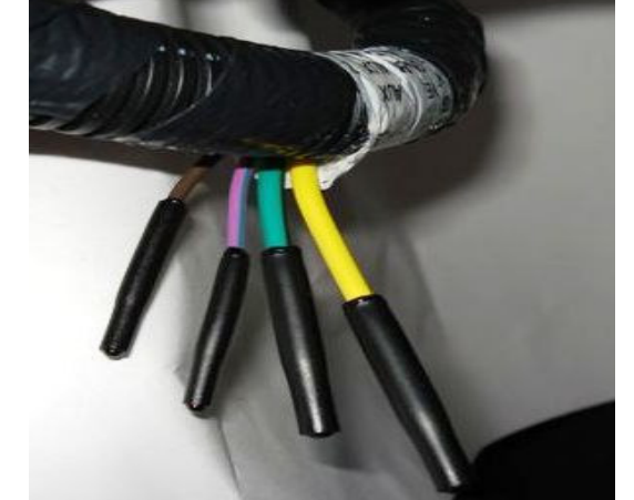
Four Blunt Cut Wires (Figure 2)

Dan Pelcher G1S1 Item Number G1S2 Classification Public