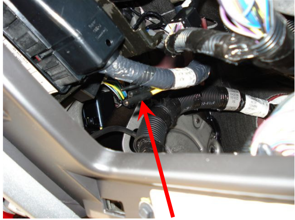
Four Blunt Cut Wires (Figure 1)