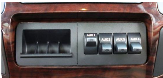
Finished installation of Upfitter Switches without Trailer Brake Controller (Coin Slot)